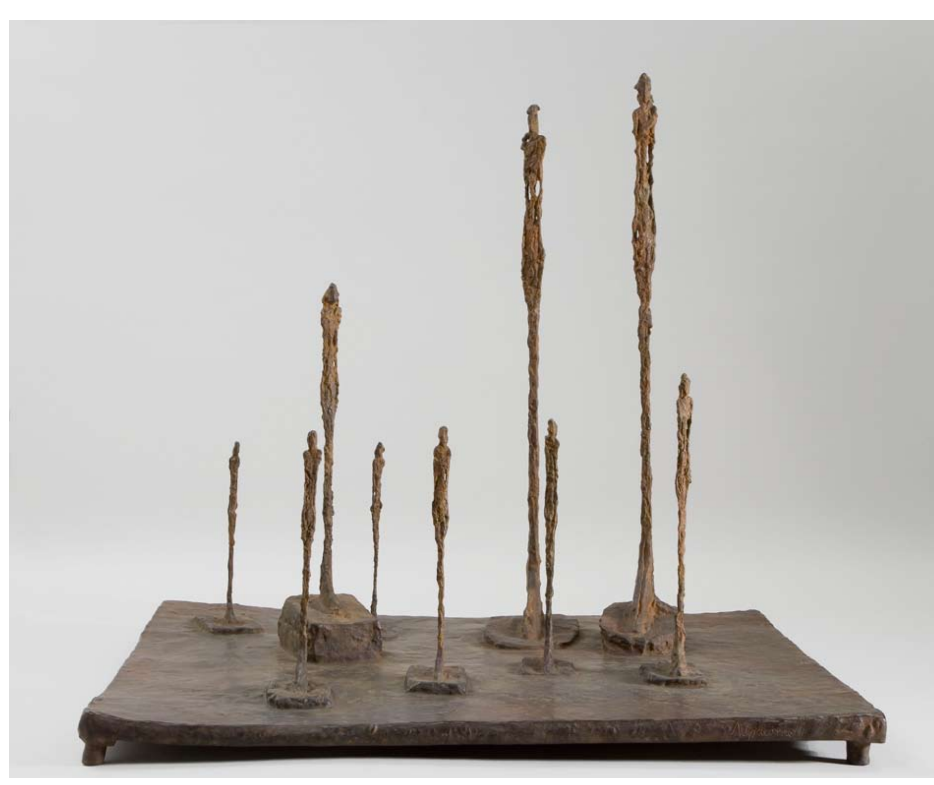
La Clairière, 1950

אלברטו ג'קומטי כבש שביל משל עצמו בין האמנים המודרניים באירופה. חיפש בחוסר מנוחה שפה אמנותית שתבטא את המציאות הכפולה. כיום עבודותיו הן אבן דרך באמנות. התערוכה הנוכחית פנים אל פנים במוזיאון הינה תערוכה הגדולה ביותר של האמןבעשרים השנה האחרונות ותערוכה זו תהפוך כנראה לתערוכה קלאסית מיצירותיו.